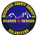
Deschutes County Mountain Rescue Unit PO Box 5722 Bend, OR 97708