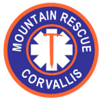
Corvallis Mountain Rescue Unit PO Box 116 Corvallis, OR 97339