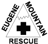
Eugene Mountain Rescue PO Box 20 Eugene, OR 97440